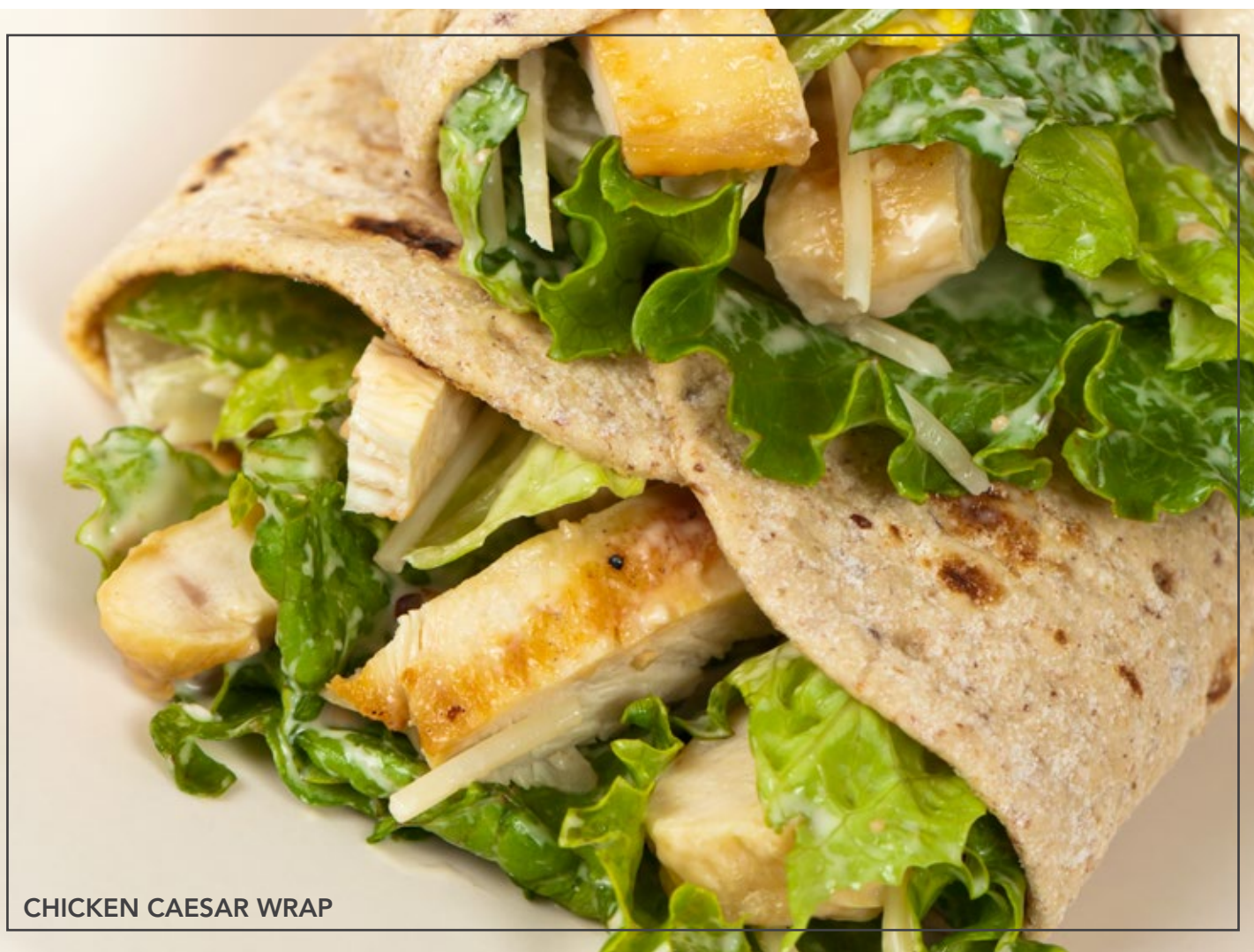
CHICKEN CAESAR WRAP