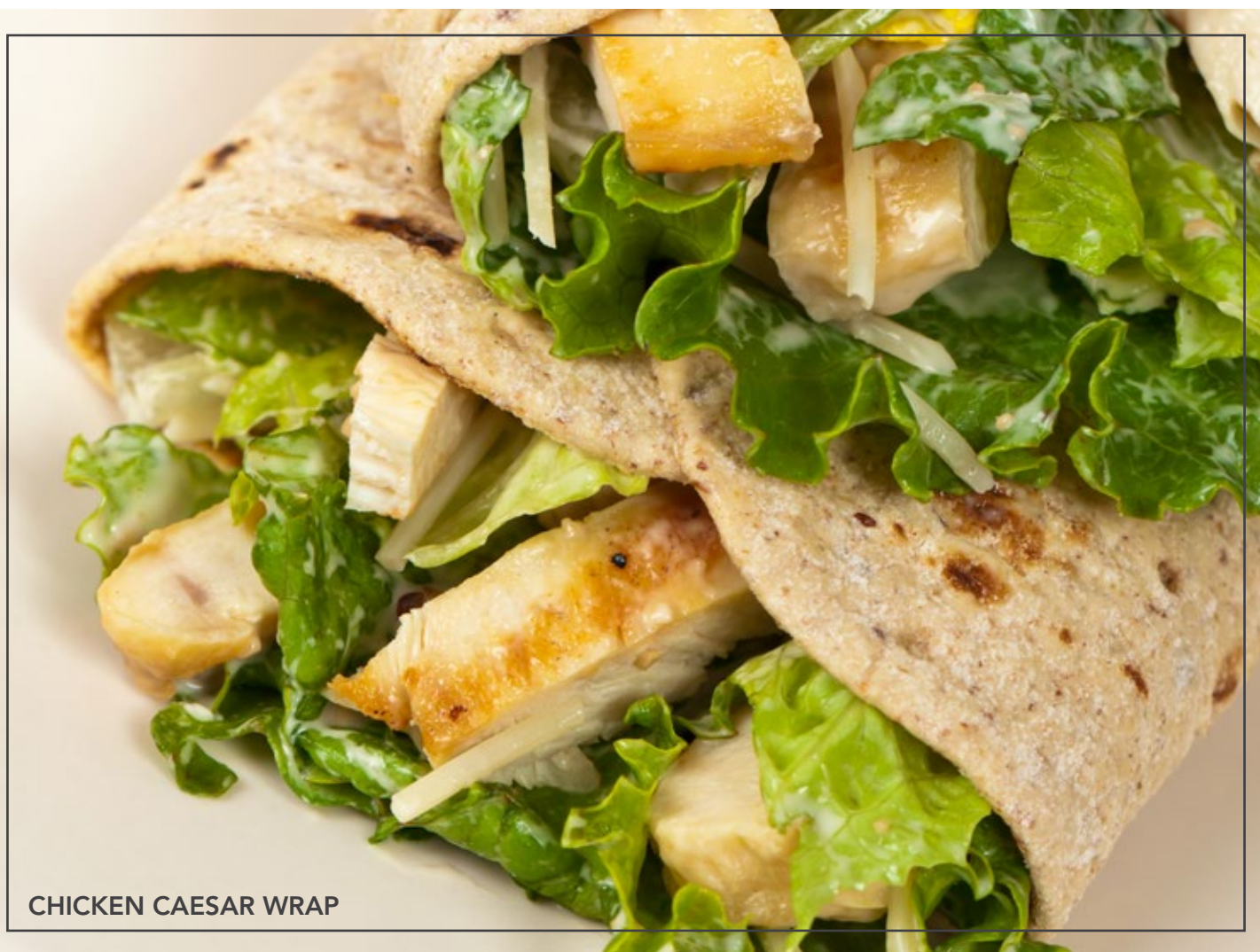
CHICKEN CAESAR WRAP