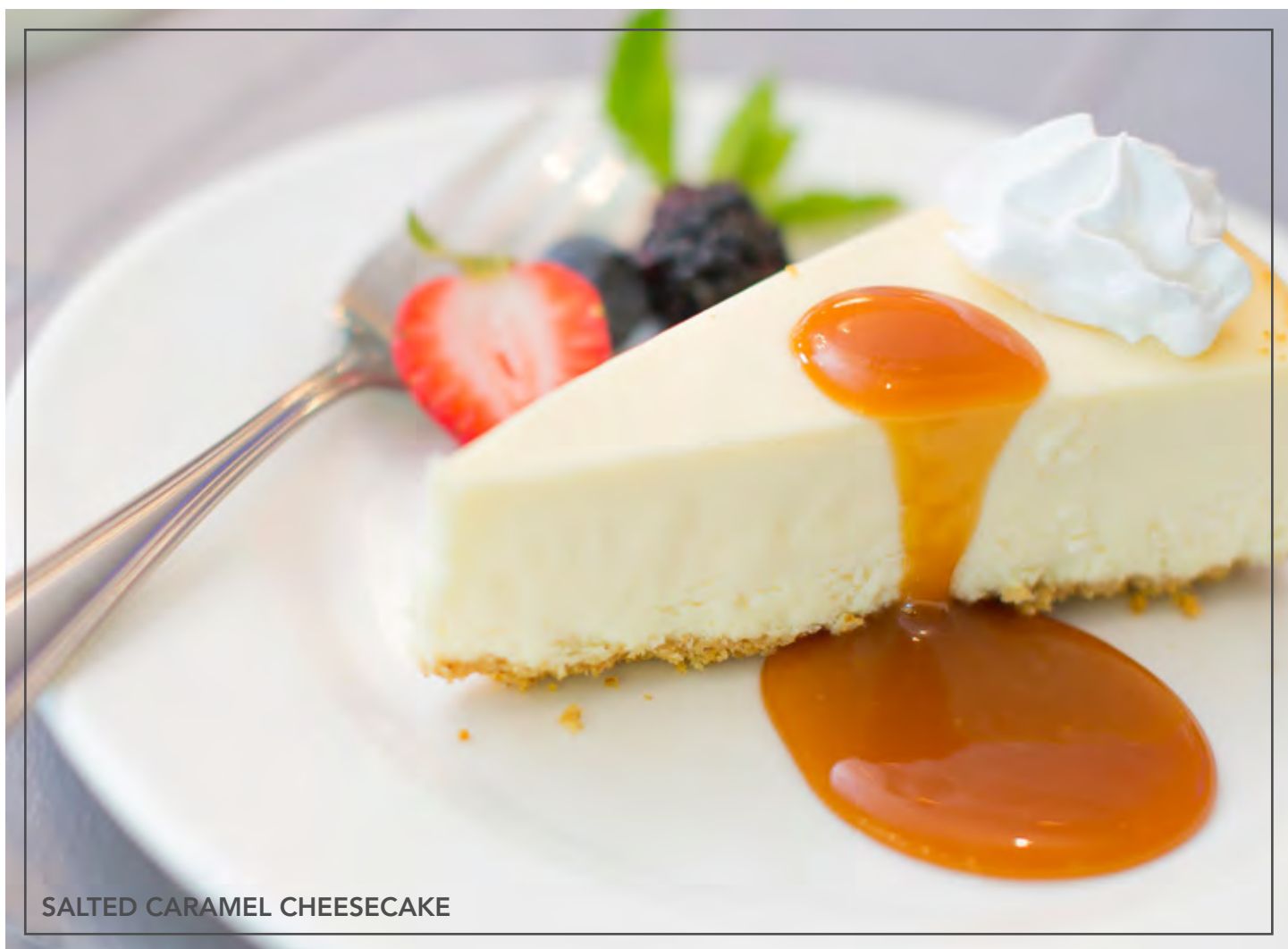
SALTED CARAMEL CHEESECAKE