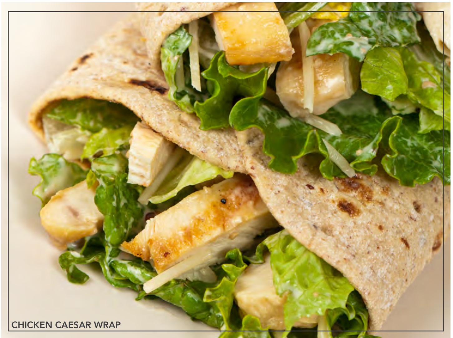
CHICKEN CAESAR WRAP