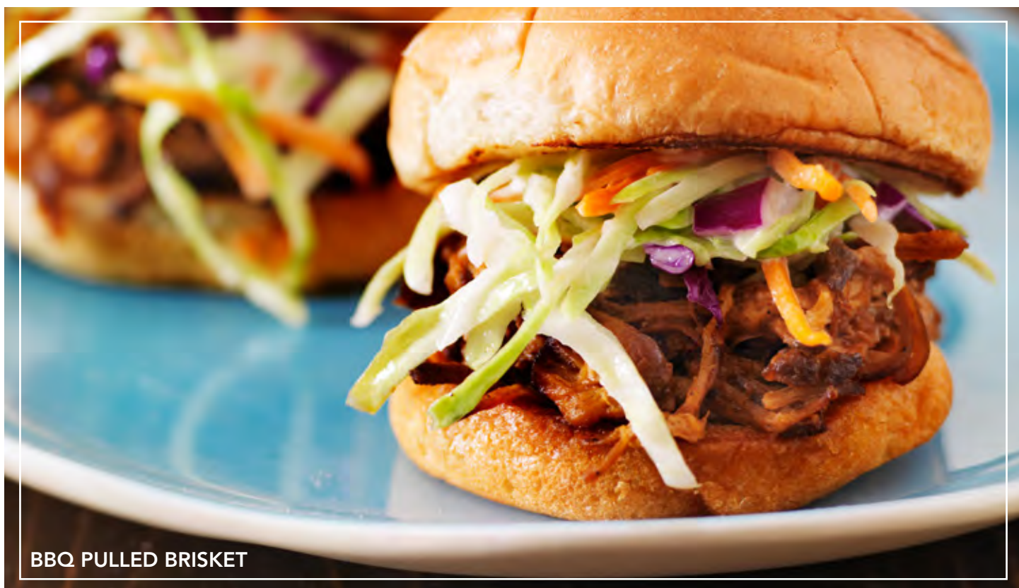
BBQ PULLED BRISKET

Riviera Gourmet Salad Greens (V): Sweet Basil Vinaigrette Chicken Breast Provençal: Tomatoes/Olives Rosemary Pork Loin: Dijon Pan Sauce Pasta Salad (V): Shell Pasta/Tomatoes/Artichokes Balsamic & Cracked Pepper New Potatoes (V) Sautéed Green Beans with Thyme (V) Fresh Fruit Salad (V) with French Baguette/Sweet Butter (V)